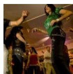
Iraqi Nightclub Crackdown Fuels 'Islamization' Fears